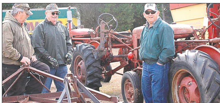
Farmers not only look for bargains, they reconnect with old friends from across the state.

Most big equipment sales are held during the winter, in the down time between harvesting and planting. "Farmers know what they