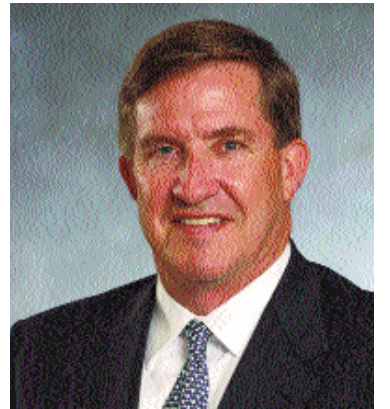
Hugh E. Weathers Commissioner

Since the creation of Certified SC Grown, SCDA also launched Fresh on the Menu, which features more than 370 restaurants serving Certified SC Grown, and the Certified SC Seafood branding.