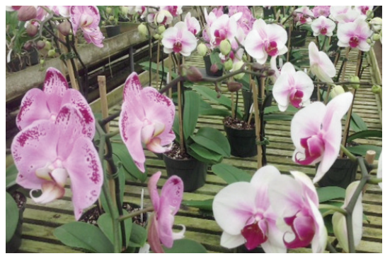
Carter and Holmes was one of the stops on the S.C. Ag Council tour.