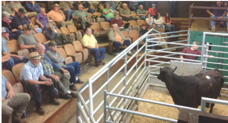
Sales are brisk at the Saluda Cattle Auction on Mondays. Individual cows like this one can bring more than $1,000, depending on weight and condition.

They are divided into categories: bred cows, cow/calf pairs, older bulls, steers, calves, bulls for breeding, and older cows. Most of the animals are sold individually, with brisk bidding