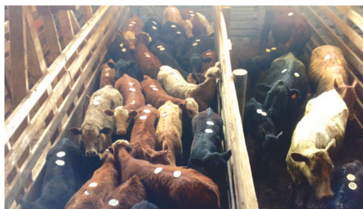
Cattle are sorted by age and weight in the holding pens behind the sales ring. Tags on their backs identify the animals.