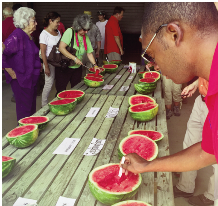
More than 80 different varieties of watermelon straight from the field were available for sampling.