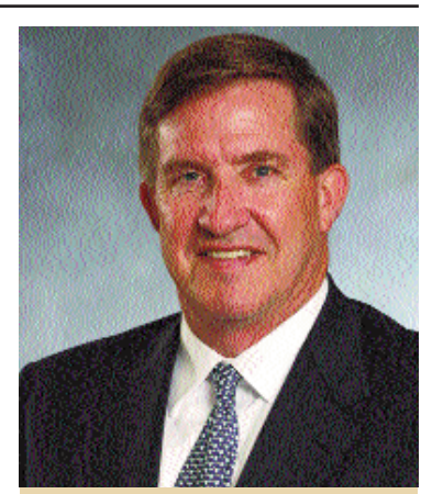
Hugh E. Weathers Commissioner