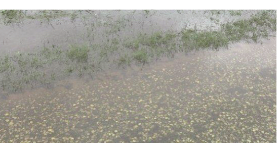
Peanuts washed to side of field.