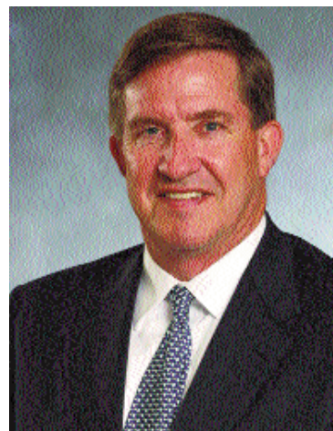
Hugh E. Weathers Commissioner

To learn more about Thoroughbred racing in South Carolina, including lists of recent winners, visit http://www.scto.org/ .