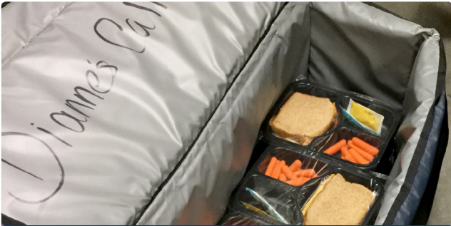
Insulated bags keep foods cold during delivery to 12 sites.