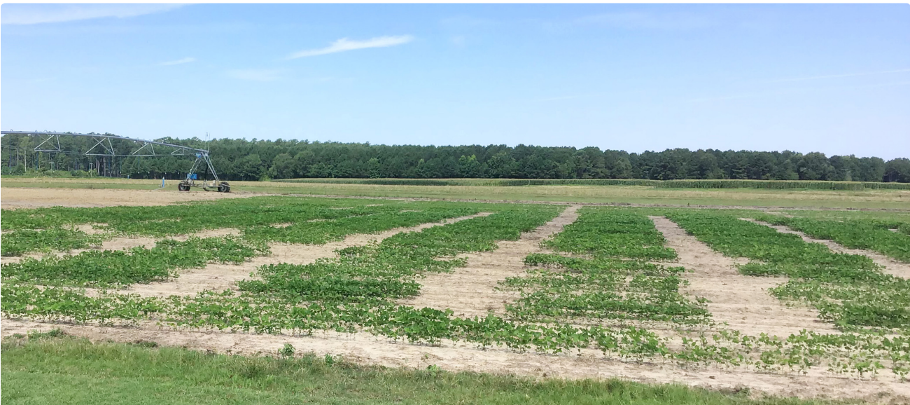
This field is planted in 10-foot plots so researchers can compare varieties and yields.