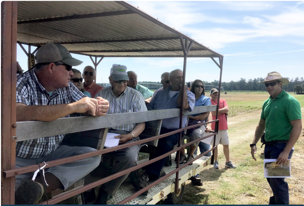
The soybean board spent the morning touring fields, learning new tillage methods, and asking questions.