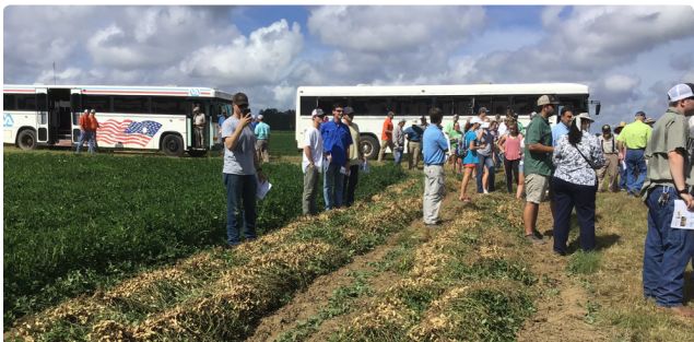
Farmers take advantage of expert demonstrations at the Edisto Research Center's Fall Field Day, with peanuts featured in the morning.

From a morning of peanuts, the field day progressed to other crops. Cotton is an excellent rotation crop for peanuts, while soybeans