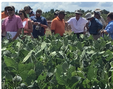
During the field day, farmers examine different plots of cotton, soybeans, sorghum, and peanuts and are able to see differences in the varieties.