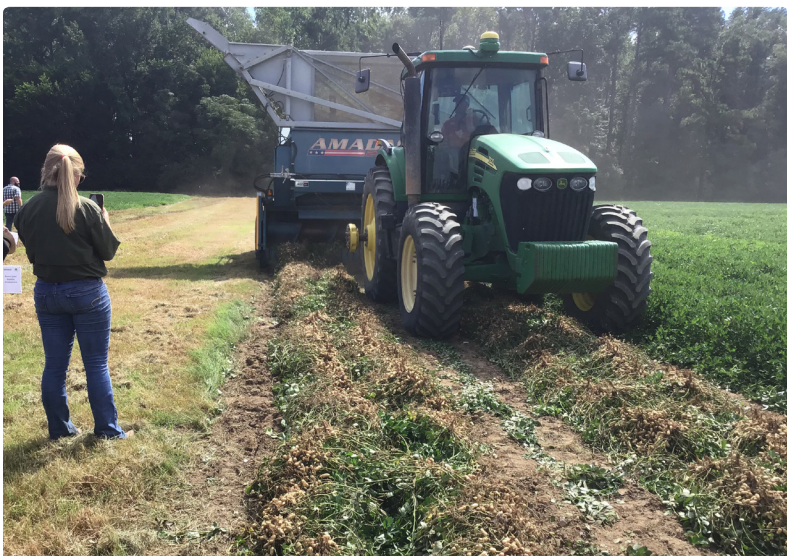
Slowing down the speed of the combine is the best way to reduce peanut loss in the field. Farmers could save up to 200 pounds per acre by harvesting at 2 mph or less.