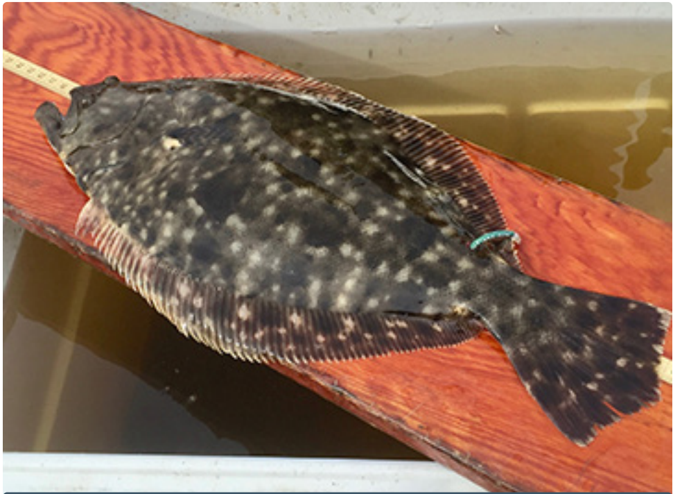
Southern flounder are at historically low levels across the Southeast; a recent suite of legislative changes aims to address that in South Carolina, including through the development of a flounder stocking program.