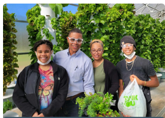
Victory Gardens International