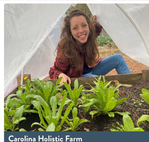
Carolina Holistic Farm