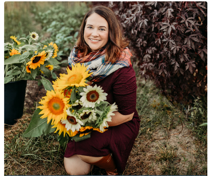
Feast & Flora