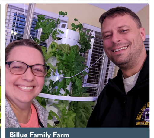
Billue Family Farm