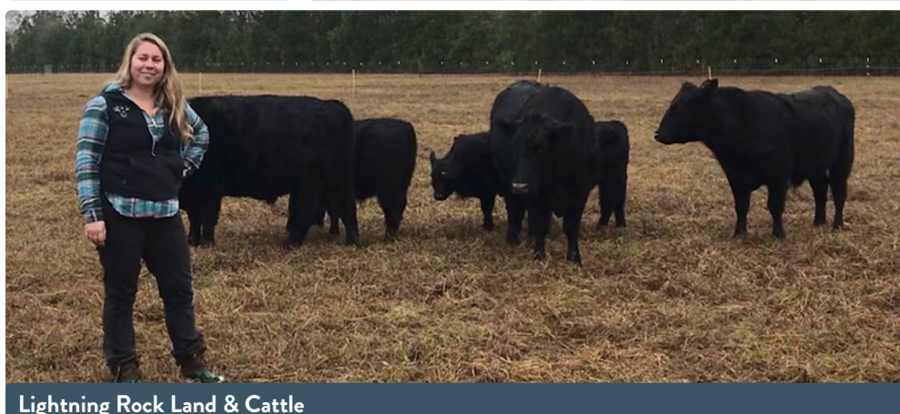
Lightning Rock Land & Cattle