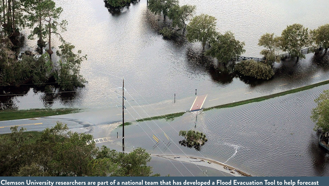
floods, identify at-risk roads and verify safe evacuation routes.