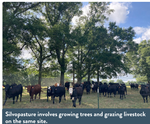
Silvopasture involves growing trees and grazing livestock on the same site.

Other field day topics include establishing a silvopasture system in woodlands by Steele. Silva