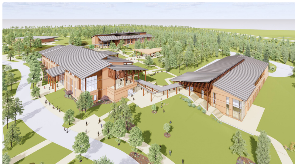
A rendering of the state’s new veterinary college

Visit clemson.edu/veterinary-medicine to learn more.