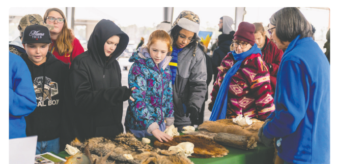
South Carolina Department of Agriculture

Hands-on activities and one-on-one conversations with natural resource professionals gave students a meaningful look at potential career pathways. Coordinated by SCDNR's Education Committee, the event received enthusiastic feedback from both students and teachers and marked an exciting new chapter in connecting youth with the future of conservation in South Carolina.