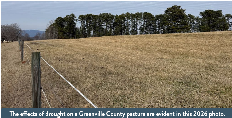
The effects of drought on a Greenville County pasture are evident in this 2026 photo.

The final rainfall totals for March 2026 tell a grim story: It was the third-driest March statewide and the driest September-to-March period since 1895. The prolonged lack of precipitation has contributed to low streamflow, depleted soil moisture, stressed pastures, and mounting concerns heading into the growing season.